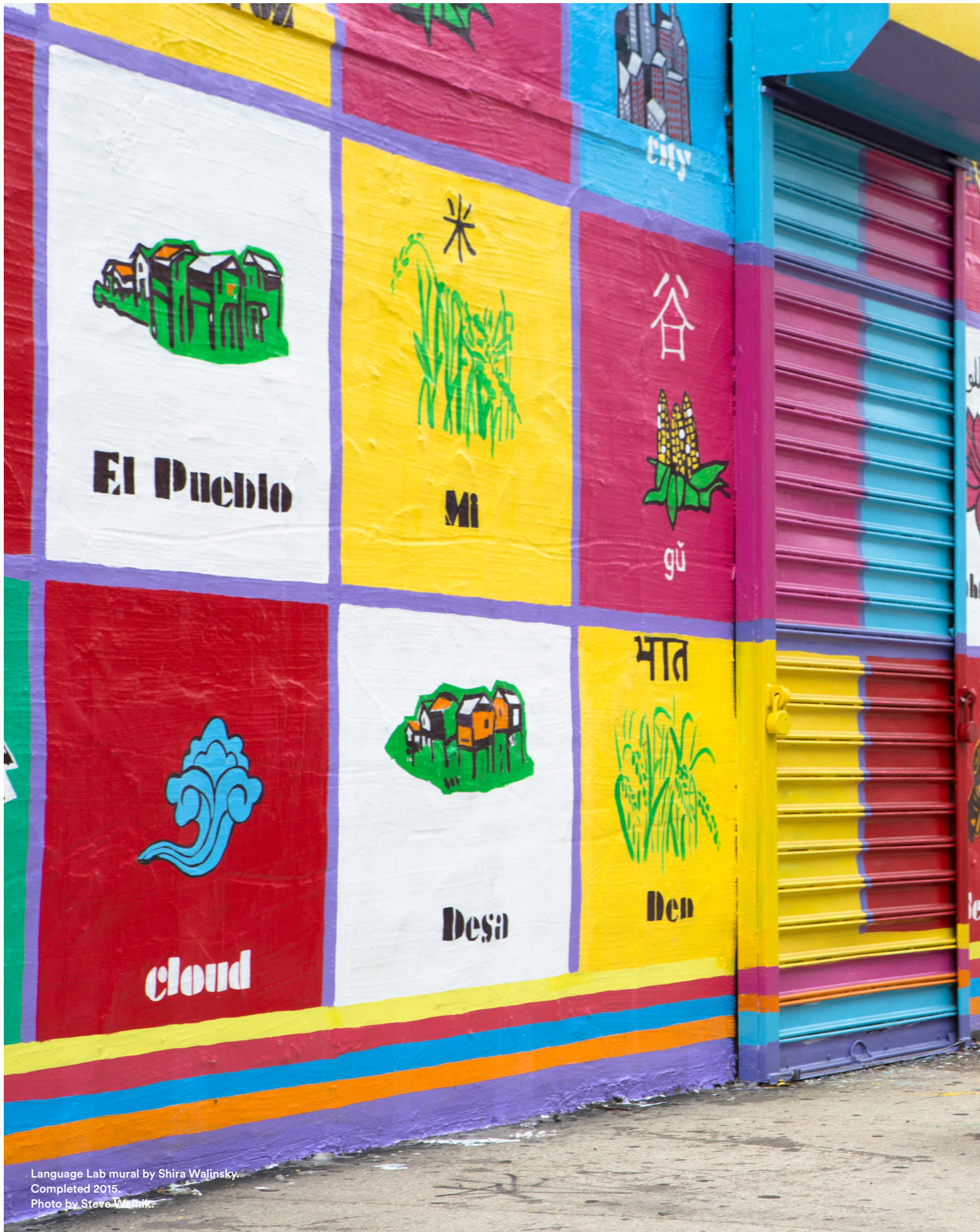
Language Lab mural by Shira Walinsky. Completed 2015.