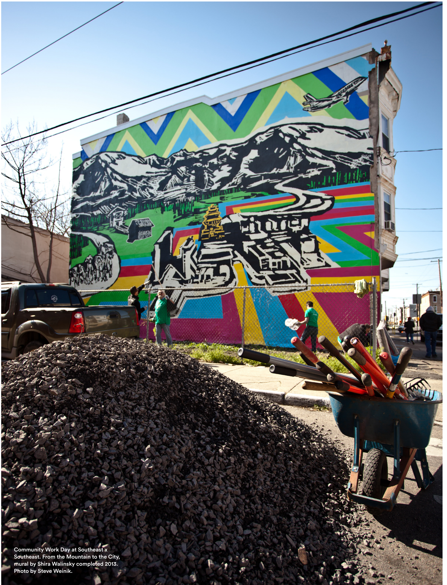
Community Work Day at Southeast x Southeast. From the Mountain to the City, mural by Shira Walinsky completed 2013.