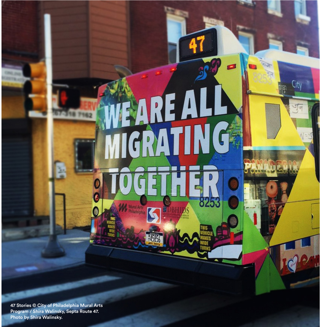
47 Stories © City of Philadelphia Mural Arts Program / Shira Walinsky, Septa Route 47.