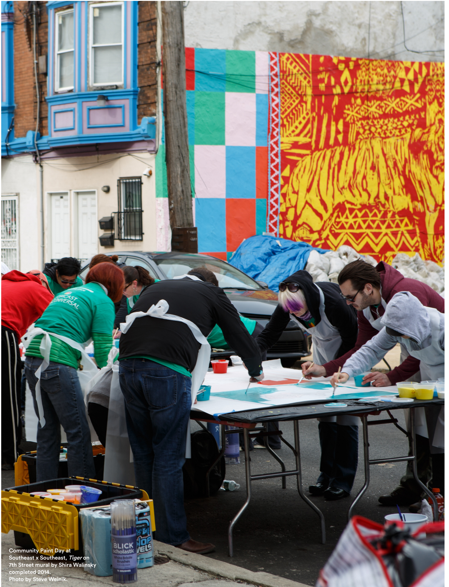
Community Paint Day at Southeast x Southeast, Tiger on 7th Street mural by Shira Walinsky completed 2014.