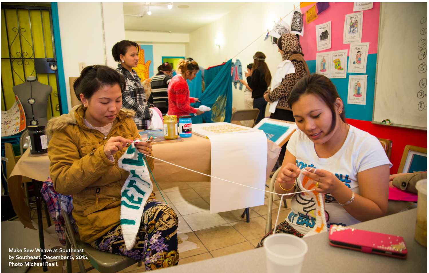
Make Sew Weave at Southeast by Southeast, December 5, 2015.

is experiencing rapid development and population shifts that threaten displacement for historically marginalized communities. Mural Arts and its collaborators should continue to be responsive to larger trends in the storefront neighborhoods. They should look for opportunities to shape and connect with larger equitable development initiatives. To stay responsive, collaborators must ensure that “on the ground” perspectives filter up to, and combine with, larger policy-level initiatives. Though challenging, staying true to comprehensive, asset-based wellness approaches will amplify the voices of community members.