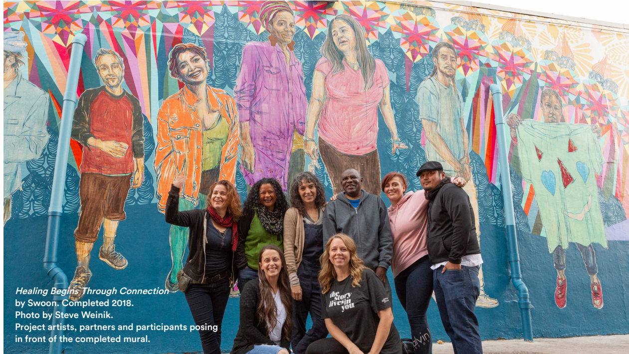
Healing Begins Through Connection by Swoon. Completed 2018. Project artists, partners and participants posing in front of the completed mural.