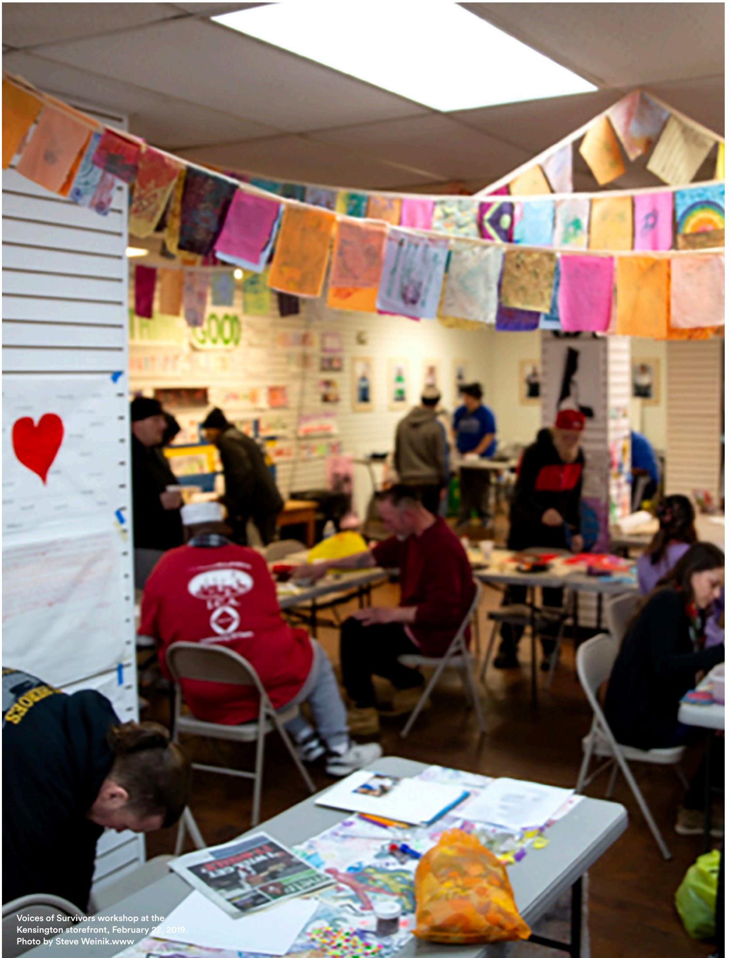
Voices of Survivors workshop at the Kensington storefront, February 22, 2019. www