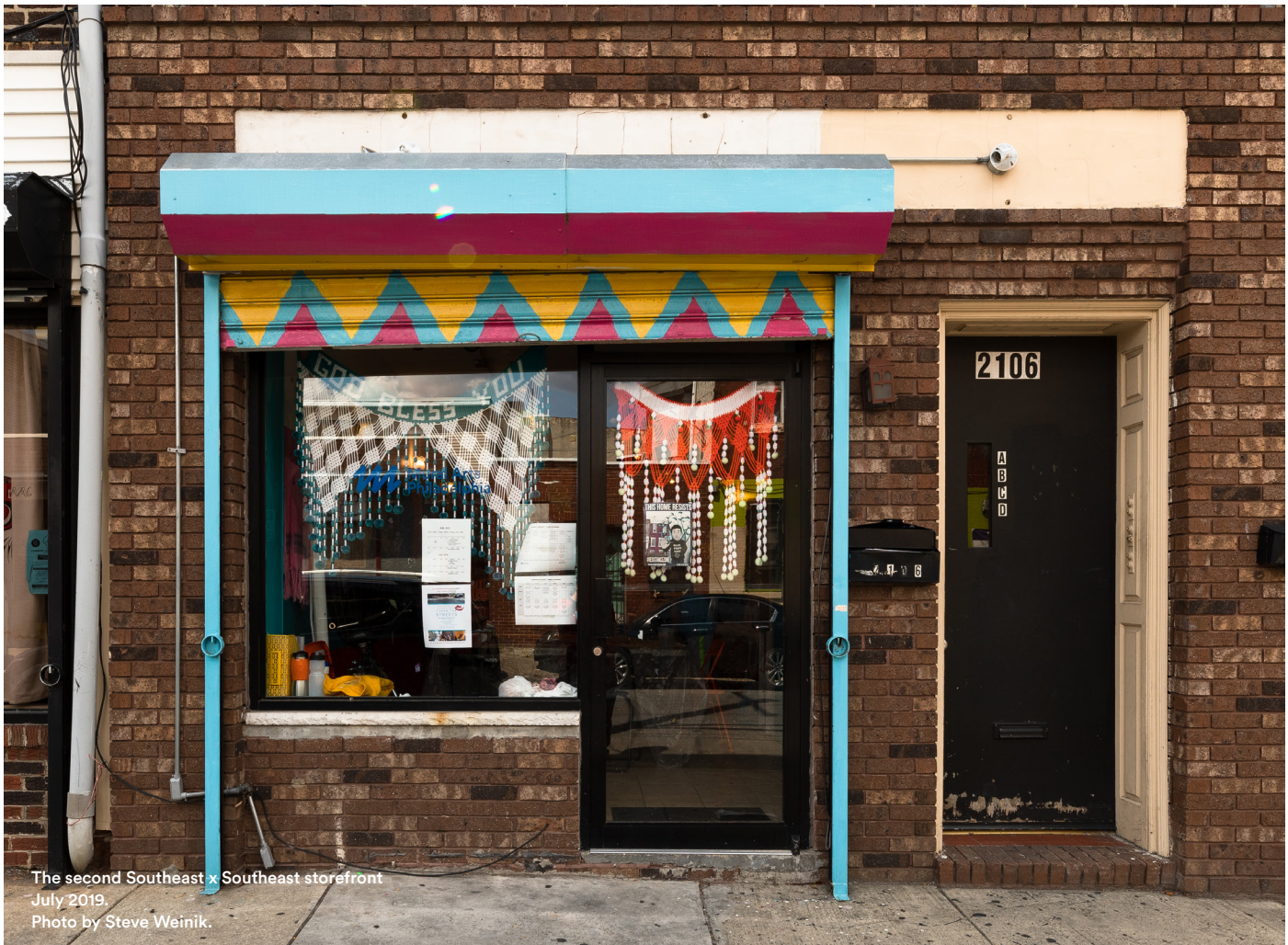
The second Southeast x Southeast storefront July 2019.

Mural Arts and DBHIDS were there to steward the relationships they had all built together. Long-term work can also lead to burnout for staff and artists. There is a danger that artists who have made long-term investments in these programs feel pressure to do too much and will be exploited creatively, emotionally, and financially. Artists should be paid fairly for their time and staff should help artists set reasonable boundaries. The Kensington Storefront learned that the artists that provide programs need to have periodic breaks to recharge and take care of themselves.