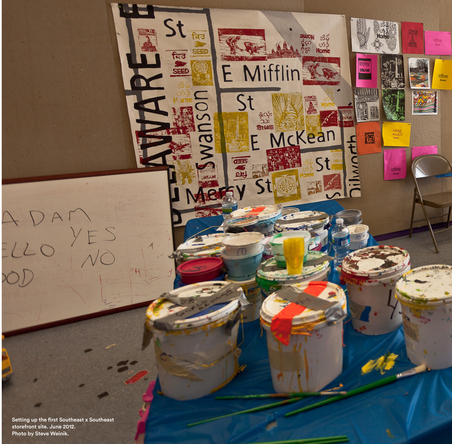
Setting up the first Southeast x Southeast storefront site. June 2012.